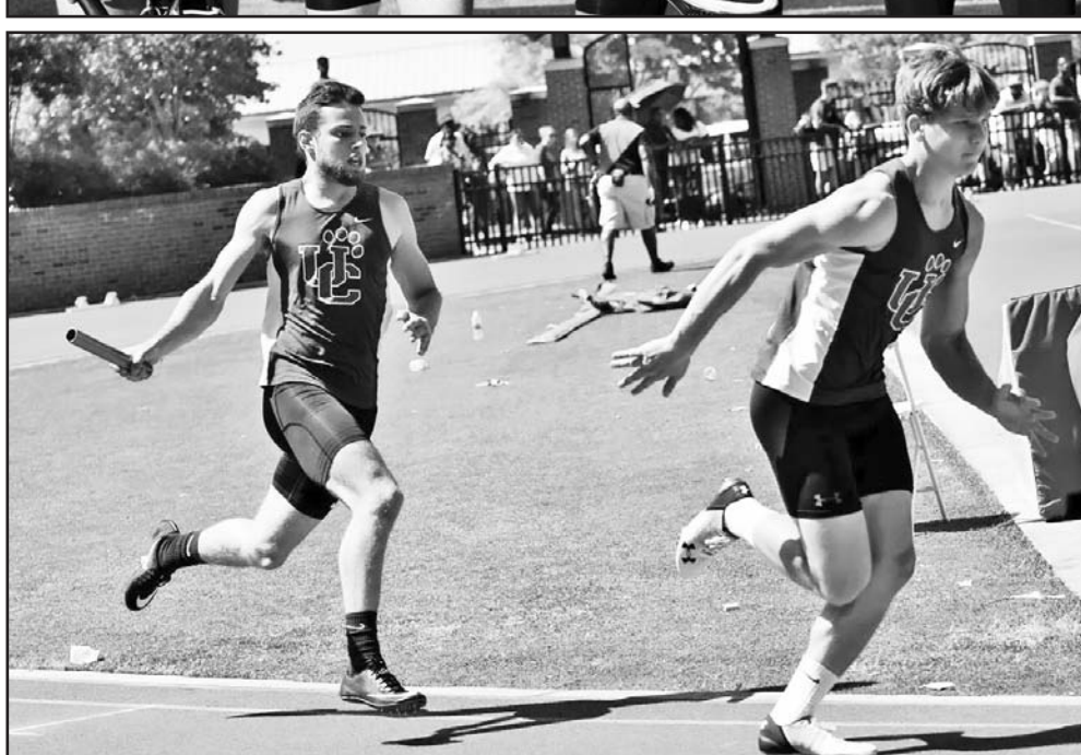
The Union County relay teams: group shot (top) and in action (below).